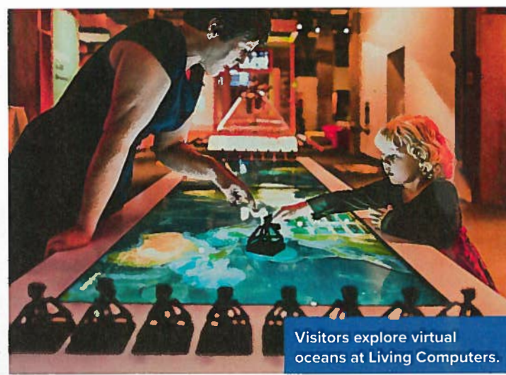
Visitors explore virtual oceans at Living Computers.