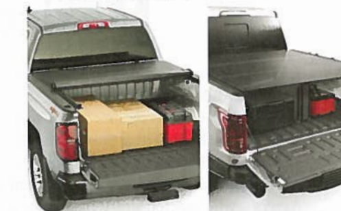
Roll Up Cover AlloyCover™ Truck Bed Covers