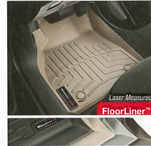
Laser Measured FloorLiner™

Available in Black, Tan and Grey (Cocoa Available for Select Applications)